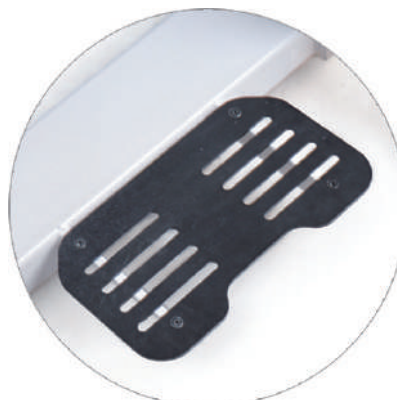
Steel pedals, strong and durable