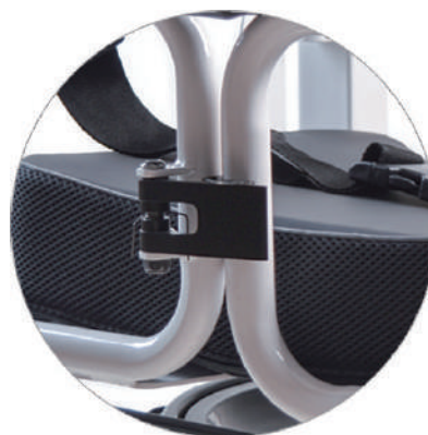
Metal safety buckle