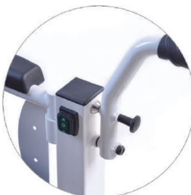
One key lifting, easy operation