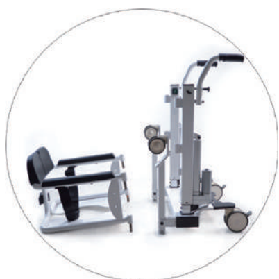
Effortlessly and easily folds down into three sections