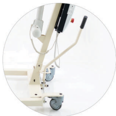
The hand lever controls the base to open and close