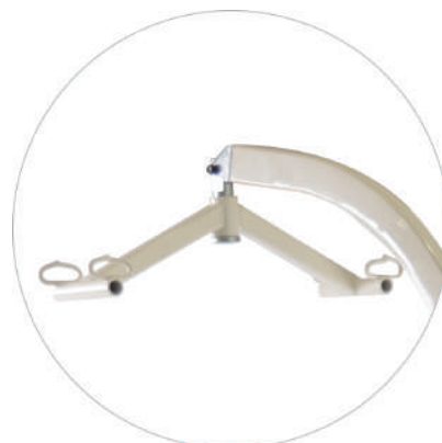
The hanger can rotate 360 ° at will