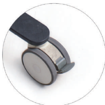
Silent universal wheel with brake