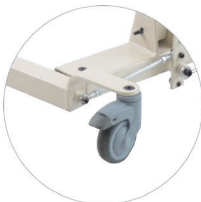
The double rear wheels are equipped with safety lock device